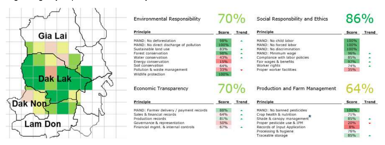
Regional analyses: Sample presentation

cultivation. The idea is to develop tailored and systemic solutions to the different challenges the various cultivation regions are facing. Detailed analyses in each region are required to identify the challenges and determine needs and underlying causes. We are currently working with our partners on developing an appropriate set of indicators. One thing is already clear: indicators regarding key aspects of biodiversity will also be included in the set.